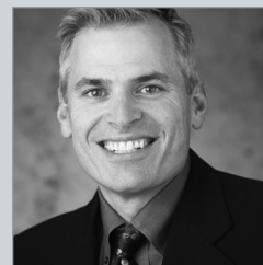
Patrick Lencioni Author of Overcoming the Five Dysfunctions of a Team: A Field Guide