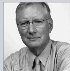
Tom Peters Author of In Search of Excellence: Lessons from America's Best Run Companies